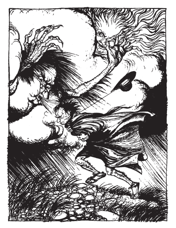
The North Wind and the Sun