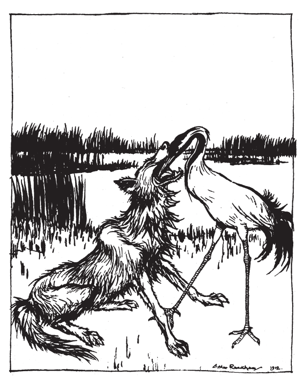
The Wolf and the Crane