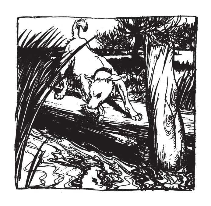
The Dog and the Shadow