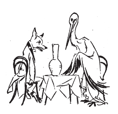
The Fox and the Stork