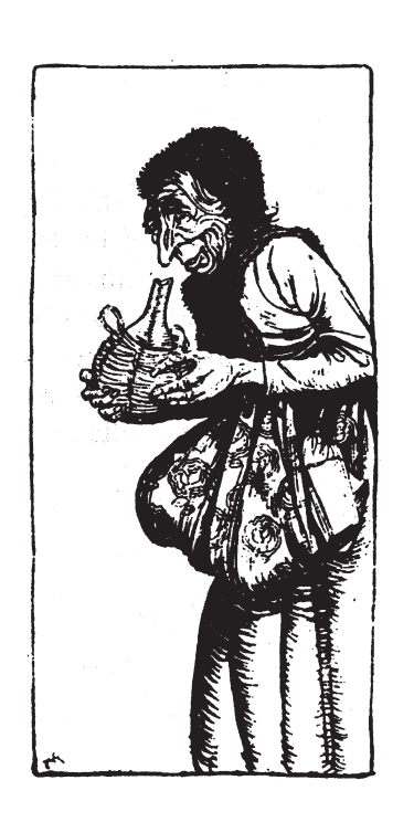
The Old Woman and the Wine-Jar