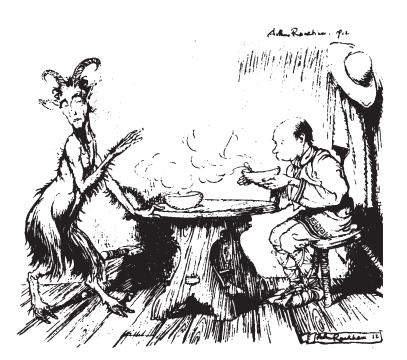
The Man and the Satyr