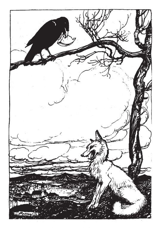
The Fox and the Crow