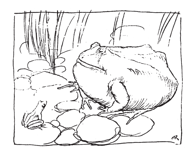
The Frog and the Ox