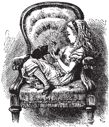
Alice and the black kitten