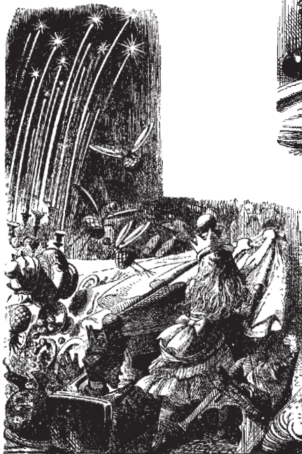
Alice seizes the table-cloth