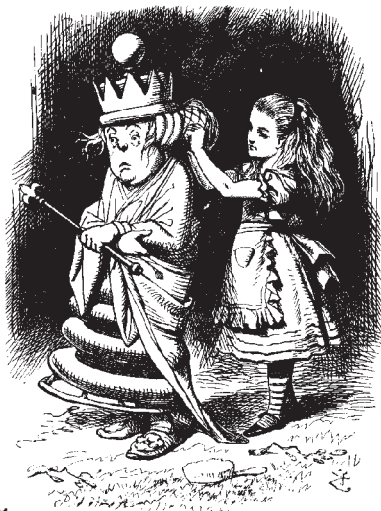
The White Queen