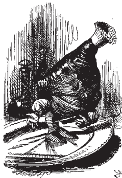
The leg of mutton