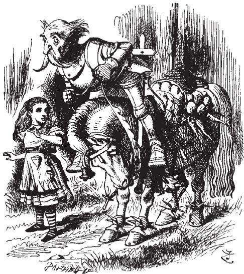
The White Knight