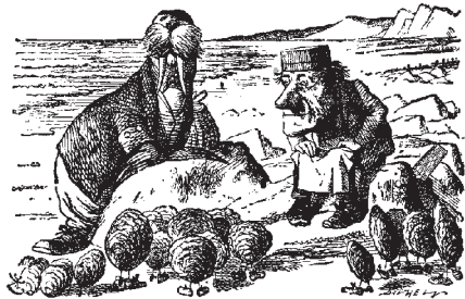
The Walrus and the Carpenter