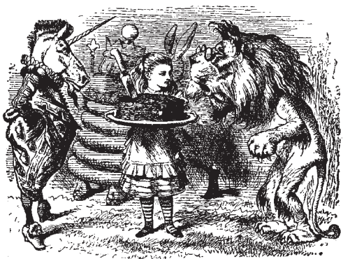
The Lion and the Unicorn