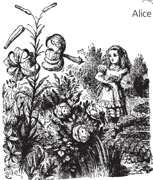
Alice and the Tiger-lily