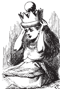
The golden crown