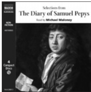
The Diary of Samuel Pepys (Pepys) 4CD – NA428812