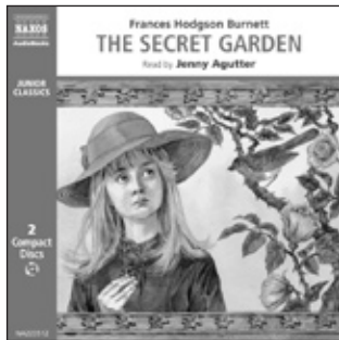
The Secret Garden (Burnett) read by Jenny Agutter ISBN 9789626342350