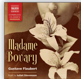
Gustave Flaubert Madame Bovary Read by Juliet Stevenson